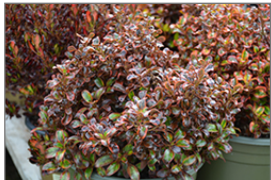
Tequila Sunrise Mirror Bush