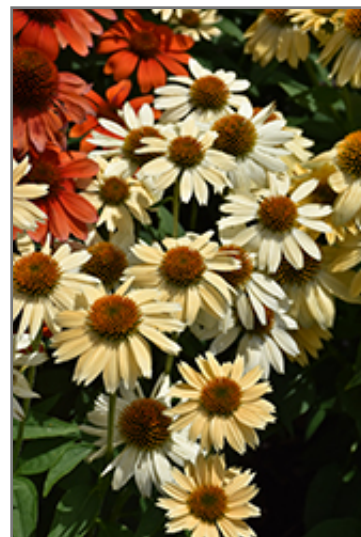
Sombrero Sandy Yellow Coneflower flowers

This is a relatively low maintenance plant, and is best cleaned up in early spring before it resumes active growth for the season. It is a good choice for attracting butterflies to your yard, but is not particularly attractive to deer who tend to leave it alone in favor of tastier treats. It has no significant negative characteristics.