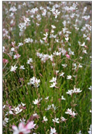
Ballerina White Gaura in bloom