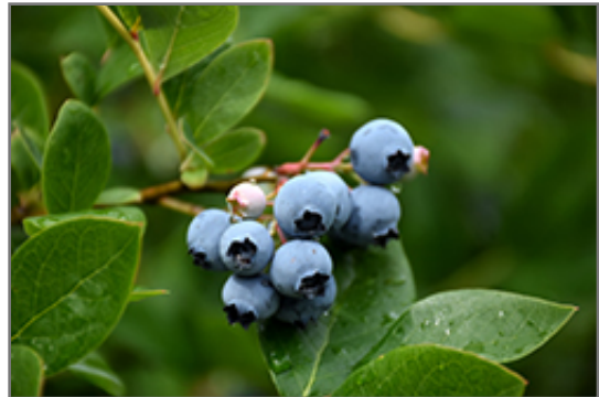
Northcountry Blueberry fruit

Northcountry Blueberry features dainty clusters of white bell-shaped flowers with shell pink overtones hanging below the branches in mid spring. It has green deciduous foliage. The glossy oval leaves turn an outstanding scarlet in the fall. It features an abundance of magnificent blue berries in mid summer.