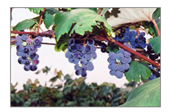
Concord Grape fruit

Concord Grape has rich green deciduous foliage on a plant with a spreading habit of growth. The lobed leaves turn yellow in fall. It produces abundant clusters of deep purple grapes with blue overtones from early to late fall.