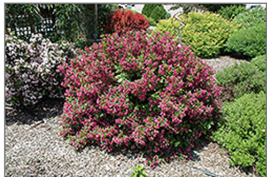
Minuet Weigela in bloom