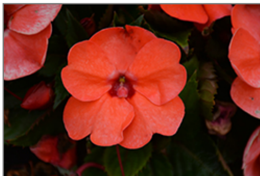
SunPatiens Compact Hot Coral New Guinea Impatiens flowers

SunPatiens Compact Hot Coral New Guinea Impatiens is a dense herbaceous annual with a mounded form. Its medium texture blends into the garden, but can always be balanced by a couple of finer or coarser plants for an effective composition.