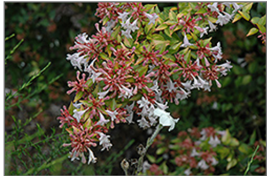
Francis Mason Abelia flowers

This shrub will require occasional maintenance and upkeep, and should only be pruned after flowering to avoid removing any of the current season's flowers. It is a good choice for attracting birds, bees and butterflies to your yard, but is not particularly attractive to deer who tend to leave it alone in favor of tastier treats. It has no significant negative characteristics.