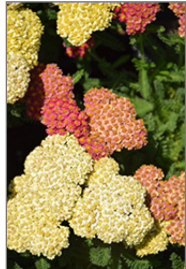
Desert Eve Terracotta Yarrow flowers