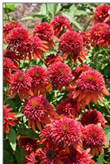
Double Scoop Orangeberry Coneflower flowers

Double Scoop Orangeberry Coneflower is recommended for the following landscape applications;