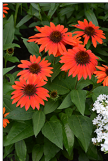
Sombrero Flamenco Orange Coneflower in bloom

This is a relatively low maintenance plant, and is best cleaned up in early spring before it resumes active growth for the season. It is a good choice for attracting butterflies to your yard, but is not particularly attractive to deer who tend to leave it alone in favor of tastier treats. It has no significant negative characteristics.