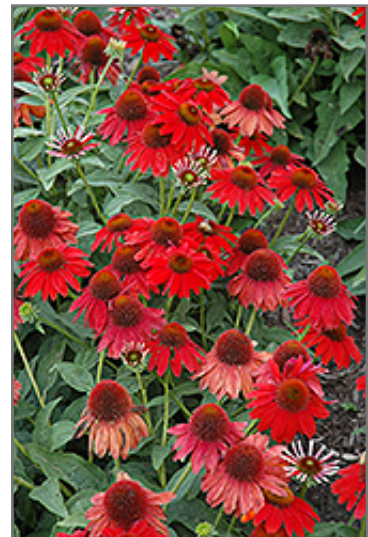
Sombrero Salsa Red Coneflower flowers

Sombrero Salsa Red Coneflower is an herbaceous perennial with an upright spreading habit of growth. Its medium texture blends into the garden, but can always be balanced by a couple of finer or coarser plants for an effective composition.