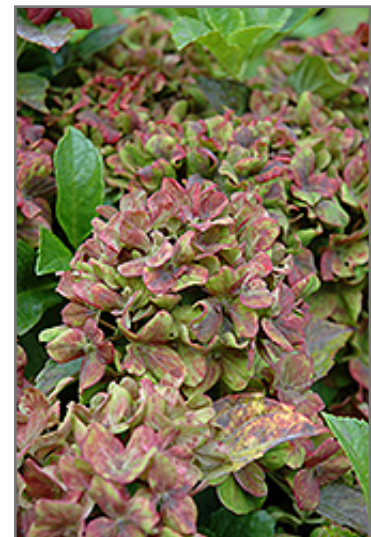
Pistachio Hydrangea flowers