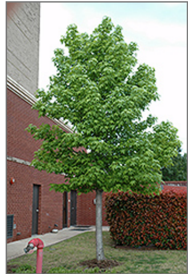
Happidaze Sweet Gum

This tree should only be grown in full sunlight. It prefers to grow in average to moist conditions, and shouldn't be allowed to dry out. It is very fussy about its soil conditions and must have rich, acidic soils to ensure success, and is subject to chlorosis (yellowing) of the foliage in alkaline soils. It is somewhat tolerant of urban pollution. This is a selection of a native North American species.