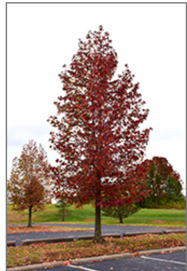
Happidaze Sweet Gum in fall