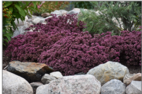
Cherry Tart Stonecrop in bloom

Cherry Tart Stonecrop is a dense herbaceous perennial with an upright spreading habit of growth. Its medium texture blends into the garden, but can always be balanced by a couple of finer or coarser plants for an effective composition.