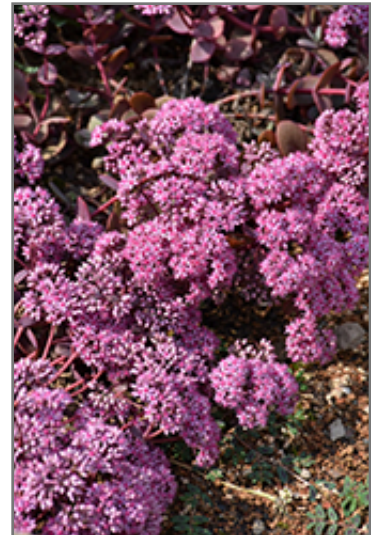
Cherry Tart Stonecrop flowers

Cherry Tart Stonecrop is a fine choice for the garden, but it is also a good selection for planting in outdoor pots and containers. It is often used as a 'filler' in the 'spiller-thriller-filler' container combination, providing a mass of flowers and foliage against which the larger thriller plants stand out. Note that when growing plants in outdoor containers and baskets, they may require more frequent waterings than they would in the yard or garden.