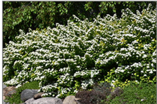
Glow Girl Birch Leaf Spirea in bloom

Glow Girl Birch Leaf Spirea is recommended for the following landscape applications;