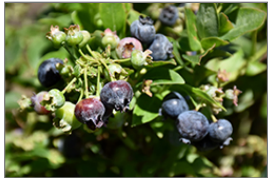
Jelly Bean Blueberry fruit