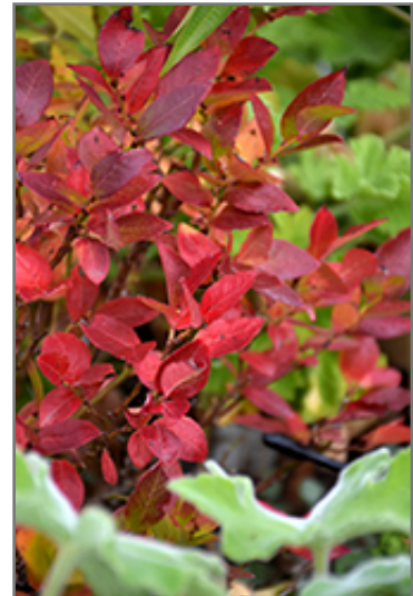
Jelly Bean Blueberry in fall

Jelly Bean Blueberry features dainty clusters of white bell-shaped flowers with shell pink overtones hanging below the branches in mid spring. It has red-variegated green foliage. The glossy oval leaves turn an outstanding red in the fall. It features an abundance of magnificent blue berries in mid summer.