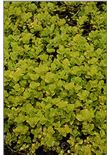
Golden Creeping Jenny foliage

Golden Creeping Jenny is recommended for the following landscape applications;