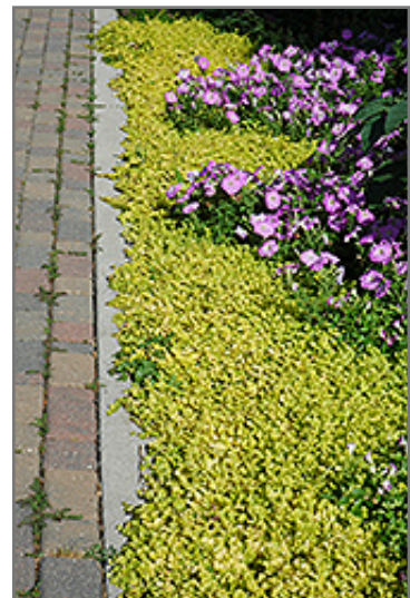
Golden Creeping Jenny