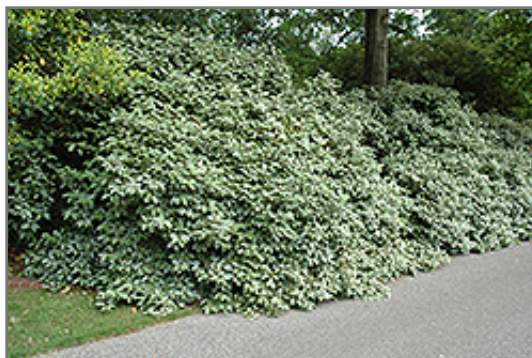
Fruitland Silverberry