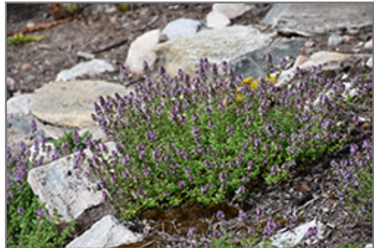
Lemon Thyme in bloom

This plant is quite ornamental as well as edible, and is as much at home in a landscape or flower garden as it is in a designated herb garden. It should only be grown in full sunlight. It prefers to grow in average to dry locations, and dislikes excessive moisture. It is considered to be drought-tolerant, and thus makes an ideal choice for a low-water garden or xeriscape application. It is not particular as to soil type or pH. It is highly tolerant of urban pollution and will even thrive in inner city environments. Consider covering it with a thick layer of mulch in winter to protect it in exposed locations or colder microclimates. This particular variety is an interspecific hybrid. It can be propagated by division; however, as a cultivated variety, be aware that it may be subject to certain restrictions or prohibitions on propagation.