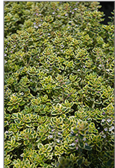
Lemon Thyme foliage

Lemon Thyme is smothered in stunning spikes of lilac purple flowers rising above the foliage from early to late summer. Its attractive tiny fragrant round leaves remain light green in color throughout the year.