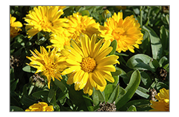
Bon Bon Yellow Pot Marigold flowers