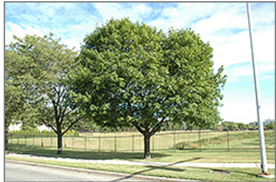
Norway Maple