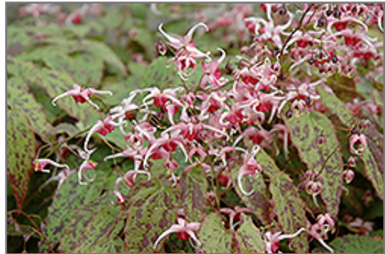
Pink Champagne Fairy Wings flowers

Pink Champagne Fairy Wings is a dense herbaceous perennial with a ground-hugging habit of growth. Its relatively fine texture sets it apart from other garden plants with less refined foliage.