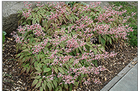
Pink Champagne Fairy Wings in bloom