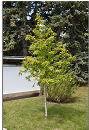
Amur Maple (tree form)