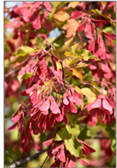
Amur Maple (tree form) fruit

* This is a 'special order' plant - contact store for details