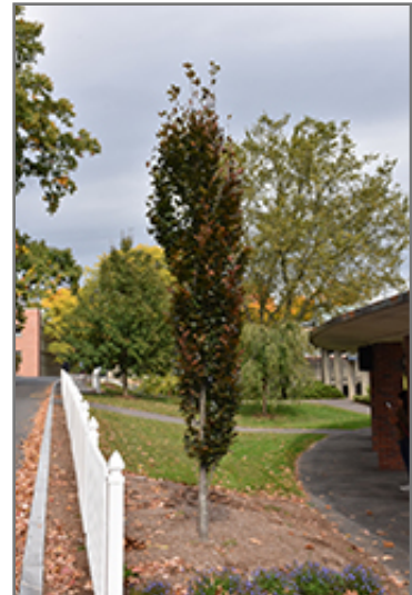
Dawyck Purple Beech

Dawyck Purple Beech is recommended for the following landscape applications;