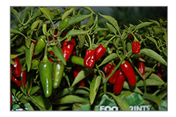
Apache Pepper fruit

Apache Pepper will grow to be about 18 inches tall at maturity, with a spread of 12 inches. This vegetable plant is an annual, which means that it will grow for one season in your garden and then die after producing a crop.