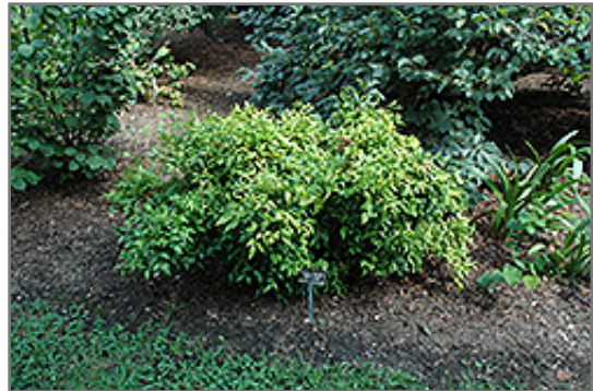
Wood's Dwarf Nandina

Wood's Dwarf Nandina is recommended for the following landscape applications;