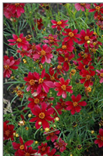
Red Satin Tickseed flowers

Red Satin Tickseed is recommended for the following landscape applications;