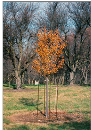
Lancelot Flowering Crab fruit