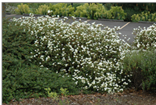
White Rockrose in bloom