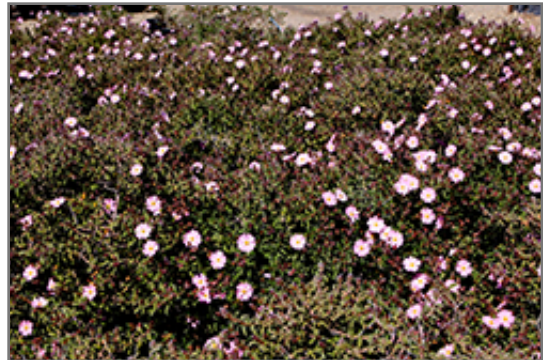
Pink Rockrose in bloom

Pink Rockrose is recommended for the following landscape applications;