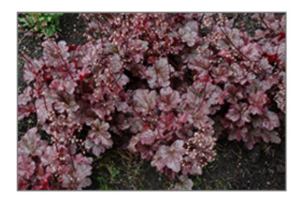
Berry Marmalade Coral Bells in bloom