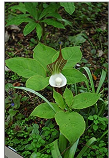
Japanese Jack-In-The-Pulpit in bloom