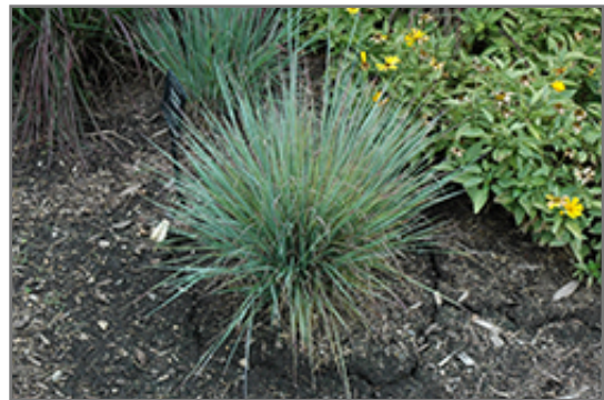
Standing Ovation Bluestem