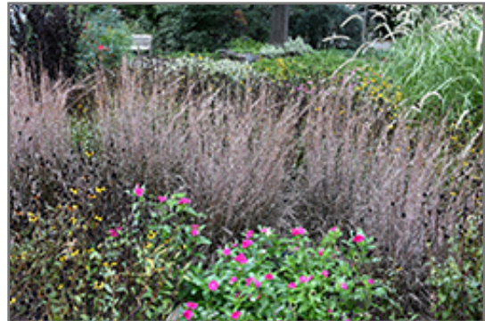
Standing Ovation Bluestem in fall

Standing Ovation Bluestem is recommended for the following landscape applications;