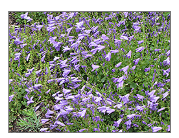
Birch Hybrid Bellflower in bloom

Birch Hybrid Bellflower is recommended for the following landscape applications;