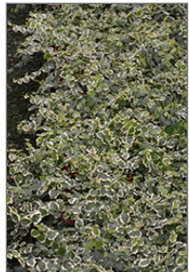
Variegated Creeping Fig in full