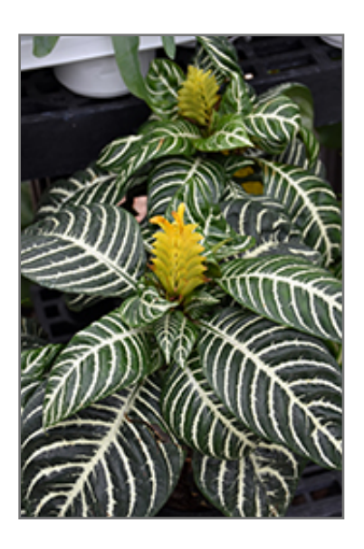
Zebra Plant in bloom

When grown indoors, Zebra Plant can be expected to grow to be about 24 inches tall at maturity extending to 3 feet tall with the flowers, with a spread of 24 inches. It grows at a medium rate, and under ideal conditions can be expected to live for approximately 10 years. This houseplant should only be grown away from direct sunlight or in a room with strong artificial light. It prefers to grow in average to moist soil. The surface of the soil shouldn't be allowed to dry out completely, and so you should expect to water this plant once and possibly even twice each week. Be aware that your particular watering schedule may vary depending on its location in the room, the pot size, plant size and other conditions; if in doubt, ask one of our experts in the store for advice. It is not particular as to soil type or pH; an average potting soil should work just fine.