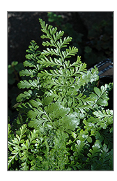
Austral Gem Bird's Nest Fern foliage

When grown indoors, Austral Gem Bird's Nest Fern can be expected to grow to be about 18 inches tall at maturity, with a spread of 18 inches. It grows at a slow rate, and under ideal conditions can be expected to live for approximately 15 years. This houseplant performs well in both bright or indirect sunlight and strong artificial light, and can therefore be situated in almost any well-lit room or location. It prefers to grow in average to moist soil. The surface of the soil shouldn't be allowed to dry out completely, and so you should expect to water this plant once and possibly even twice each week. Be aware that your particular watering schedule may vary depending on its location in the room, the pot size, plant size and other conditions; if in doubt, ask one of our experts in the store for advice. It is particular about its soil conditions, with a strong preference for rich, acidic soil. Contact the store for specific recommendations on pre-mixed potting soil for this plant. Be warned that parts of this plant are known to be toxic to humans and animals, so special care should be exercised if growing it around children and pets.