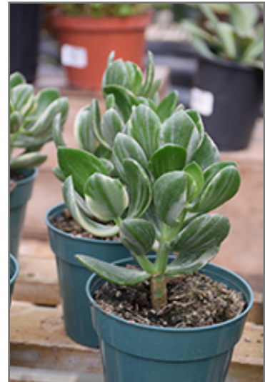
Variegated Jade Plant in full

This is a multi-stemmed evergreen houseplant with an upright spreading habit of growth. This plant can be pruned at any time to keep it looking its best.