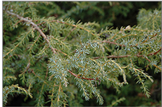
Common Juniper foliage