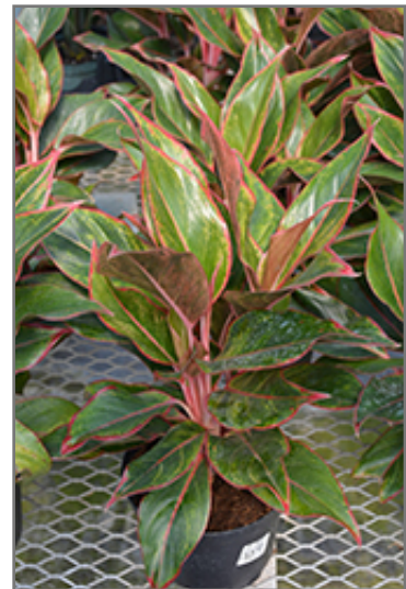
Siam Aurora Chinese Evergreen in full