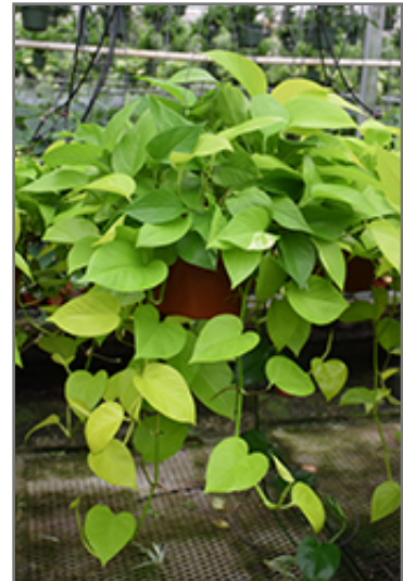
Neon Pothos in full

This is an herbaceous evergreen houseplant with a spreading, ground-hugging habit of growth. This plant can be pruned at any time to keep it looking its best.