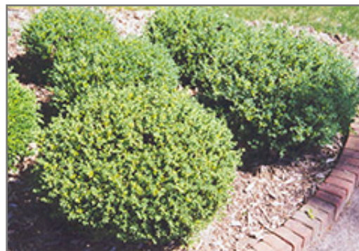
Japanese Boxwood