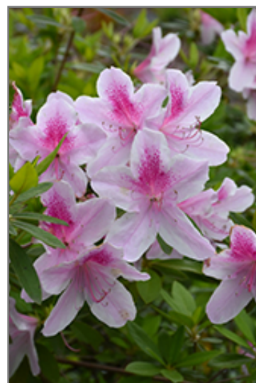
George Lindley Taber Azalea flowers

George Lindley Taber Azalea is recommended for the following landscape applications;