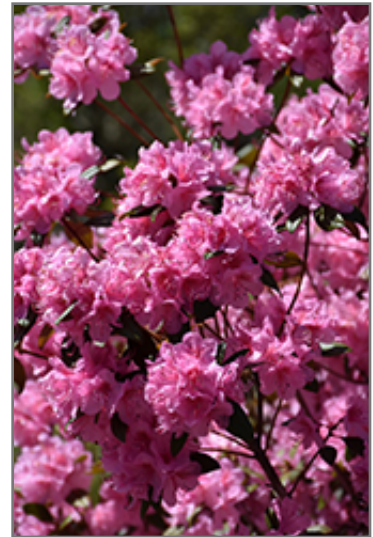
Weston's Aglo Rhododendron flowers

Weston's Aglo Rhododendron is recommended for the following landscape applications;