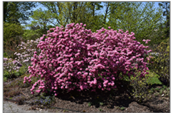
Weston's Aglo Rhododendron in bloom