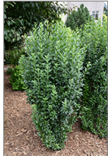
Straight Talk Privet