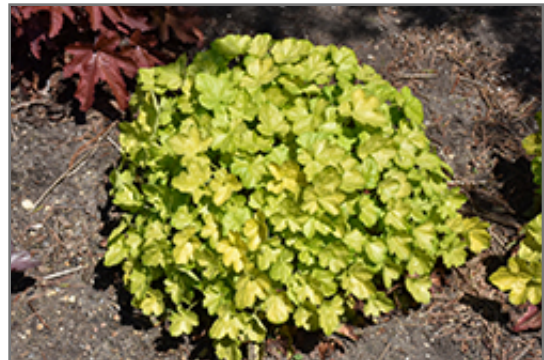
Dolce Appletini Coral Bells