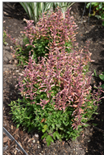
Mango Tango Hyssop in bloom