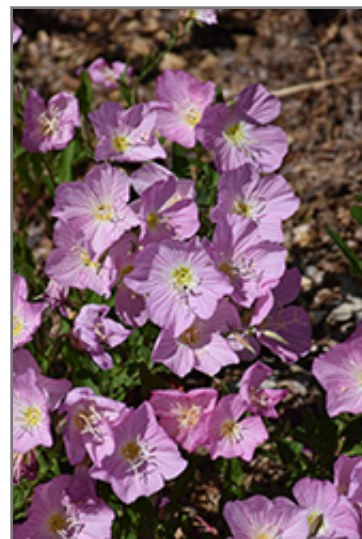
Twilight Evening Primrose flowers