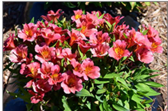
Colorita Eliane Alstroemeria in bloom